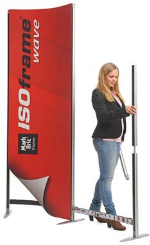
8 Follow the procedures shown above to build the new post to the height of the starter section. Add more modules as desired.