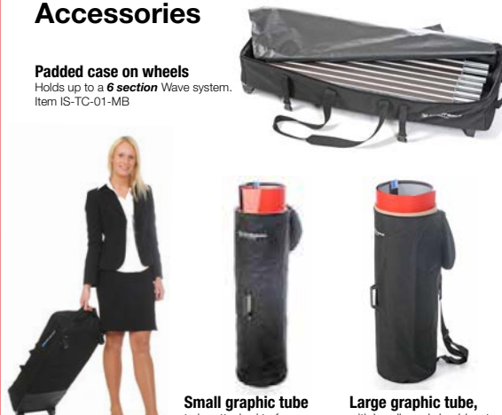
Small graphic tube to be attached to frame case Holdsu pto 6 panels, Item IS-0850-RTS-S-MB Large graphic tube, with handle and shoulder strap. Holds up to 9 panels, Item IS-0850-RTB-S-MB

Magnetic tape for graphic panels are not included .