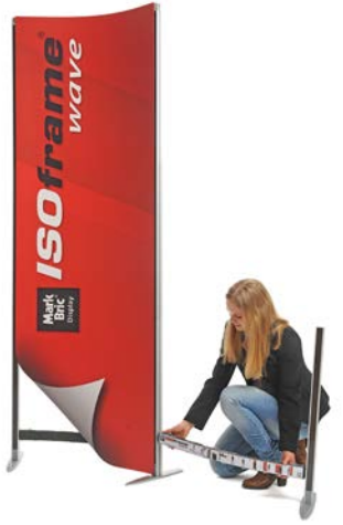
Now you can add an Extension Module onto the starter section just built. Create a foot+base post+Flexi-Link assembly as before, then insert the link into a base post of the starter module and press down into place.