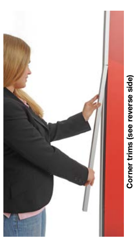
9 When the Wave wall is complete, finish each end by placing a set of 3 corner trims on the exposed magnets of the post.